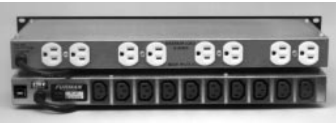
Rear Views: Top, 120V units; bottom, 220/240V ("E" suffix) units. The 120V outlets are spaced sufficiently far apart to accommodate three or four "wall wart" cord-mounted power supplies without blocking the adjacent outlets.